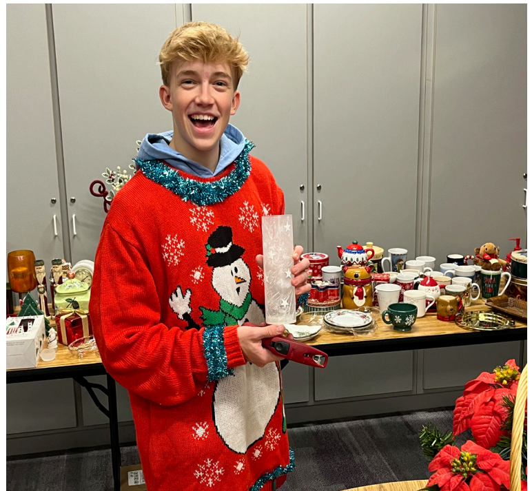
Youth Christmas Sale