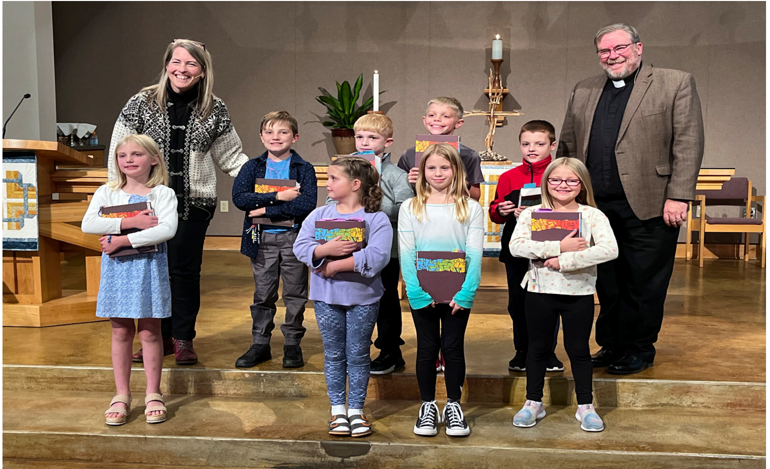
Third Grade Bibles