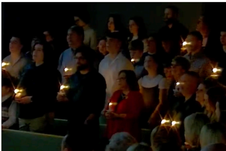
Christmas Eve Service