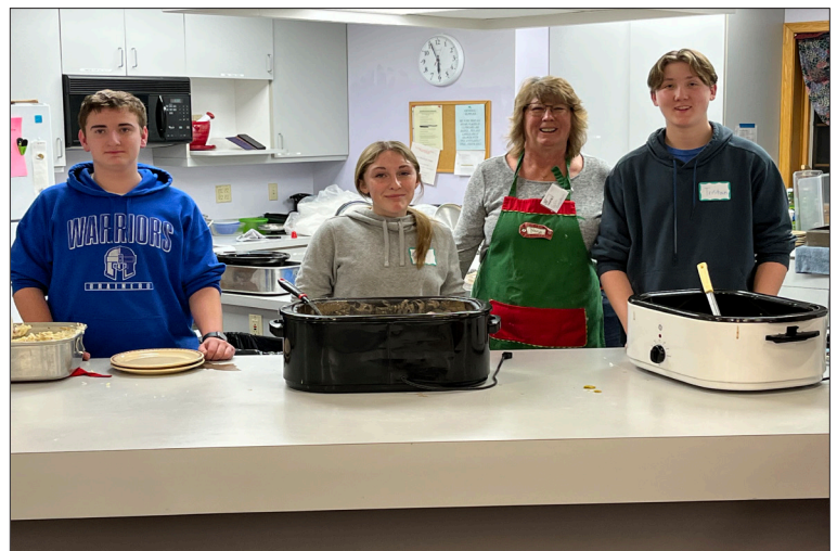
Swedish Meatball Dinner