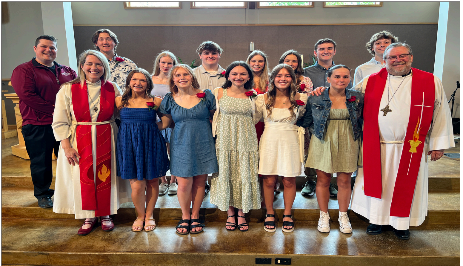
Affirmation of Baptism Service

Join us for the Lord of Life Annual Meeting June 2nd, at 10:45 am